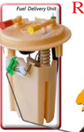
Fuel Delivery Unit