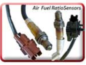
Air Fuel Ratio Sensors