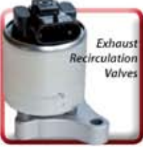
Exhaust Recirculation Valves