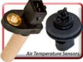
Air Temperature Sensors