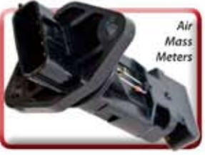
Air Mass Meters