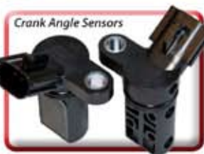
Crank Angle Sensors