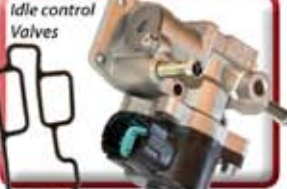
Idle control Valves