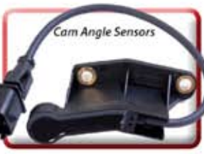
Cam Angle Sensors