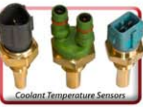
Coolant Temperature Sensors