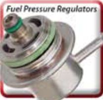
Fuel Pressure Regulators