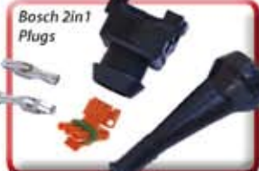
Bosch 2in1 Plugs