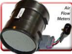
Air Flow Meters