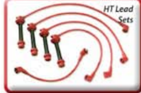
HT Lead Sets