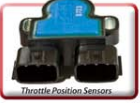
Throttle Position Sensors